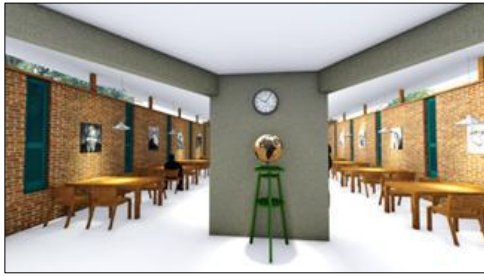
VIEW FROM ENTRANCE LOBBY