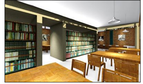
VIEW FROM STUDY AREA