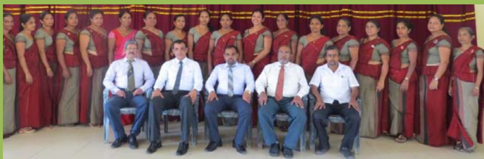
Mawathagama Public Library: All staff members with administrative officers and the project team

Discussion with the Minister: The Minister of Provincial Councils and Local Government had invited the '40 Libraries Automation Project team' of the Open University of Sri Lanka for a discussion of the progress of the project.