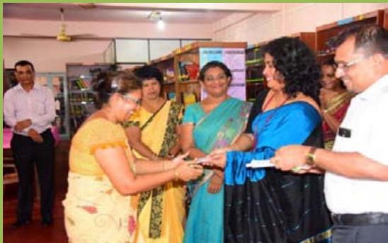
Kotahena Public Library: The Inaugural ceremony

Mawathagama Pradeshiya Saba Public Library, Kotahena Public Library and Nawalapitiya Pradeshiyasaba Public Library, are the first 3 automated public libraries under the automation project targeted to empower 40 public libraries island wide with modern technology. These three libraries have shown the dedication and strength of their staff members by successfully completing project targets within 3 months and inaugurated the services to the public.