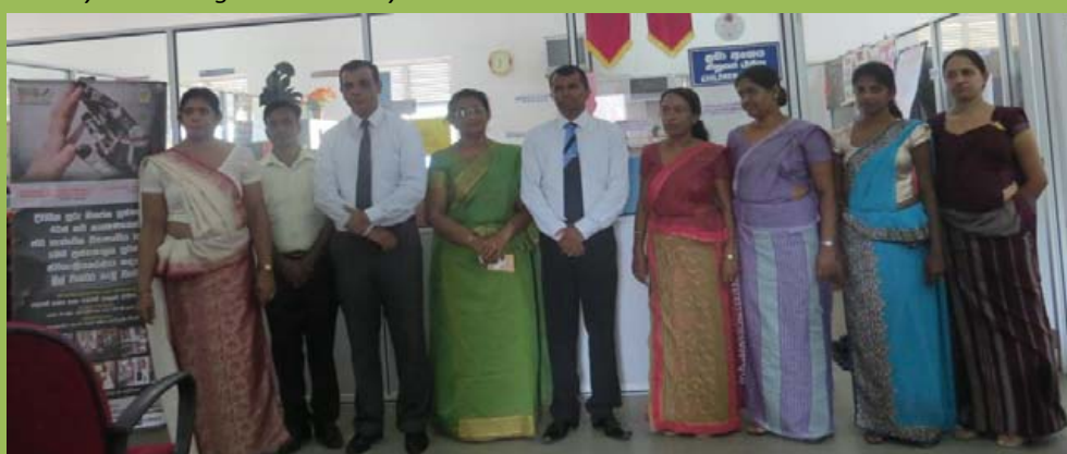
Nawalapitiya Public Library : All staff members with Project team

The Project is expected uplift the quality of the library services by adhering to the international standards. Well established Open Source Software was used for the project to ensure the its sustainability. Librarians are learning by practice during the project training period by going through a vigorous self training session with support of the Library Services of the Open University of Sri Lanka who is the learning library technology consultancy service provider Sri Lanka. The project is supporting 30 public libraries which represent all districts in Sri Lanka.