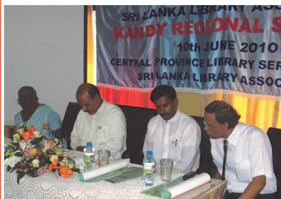
SLLA Golden Jubilee Regional Seminar in Kandy was held on 10th June 2010.