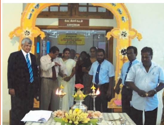
The Jaffna Regional Seminar was held on 30th July 2010 at the Jaffna Public Library Auditorium.