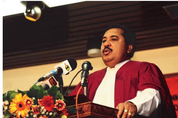
Hon. T B Ekanayake, Deputy Minister of Education