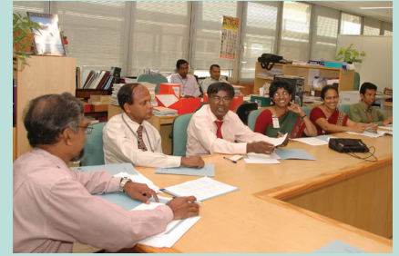
Participants at the meeting