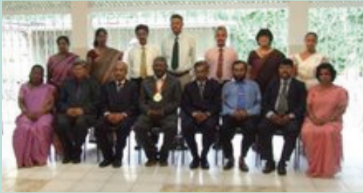
Council Members - 2008/09 Sri Lanka Library Association