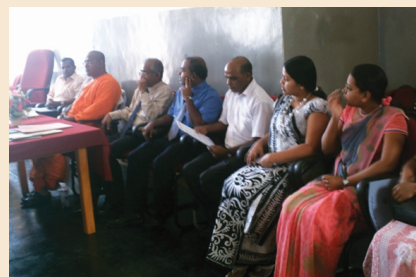
Lecturers and other Guests at Badulla Center