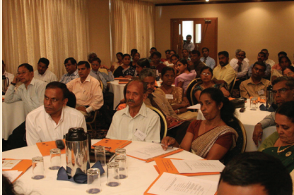
Participants at the ALP workshop