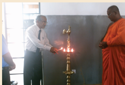
Inauguration of Badulla Center