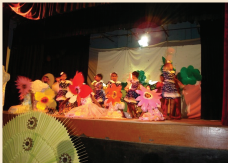
Children Performing at the Concert