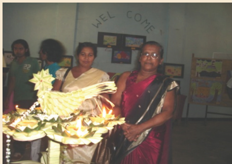
Inauguration of the Concert & Art Exhibition