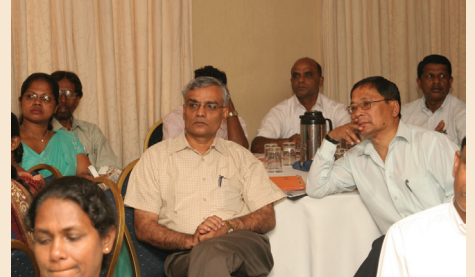
Participants - from India and Nepal